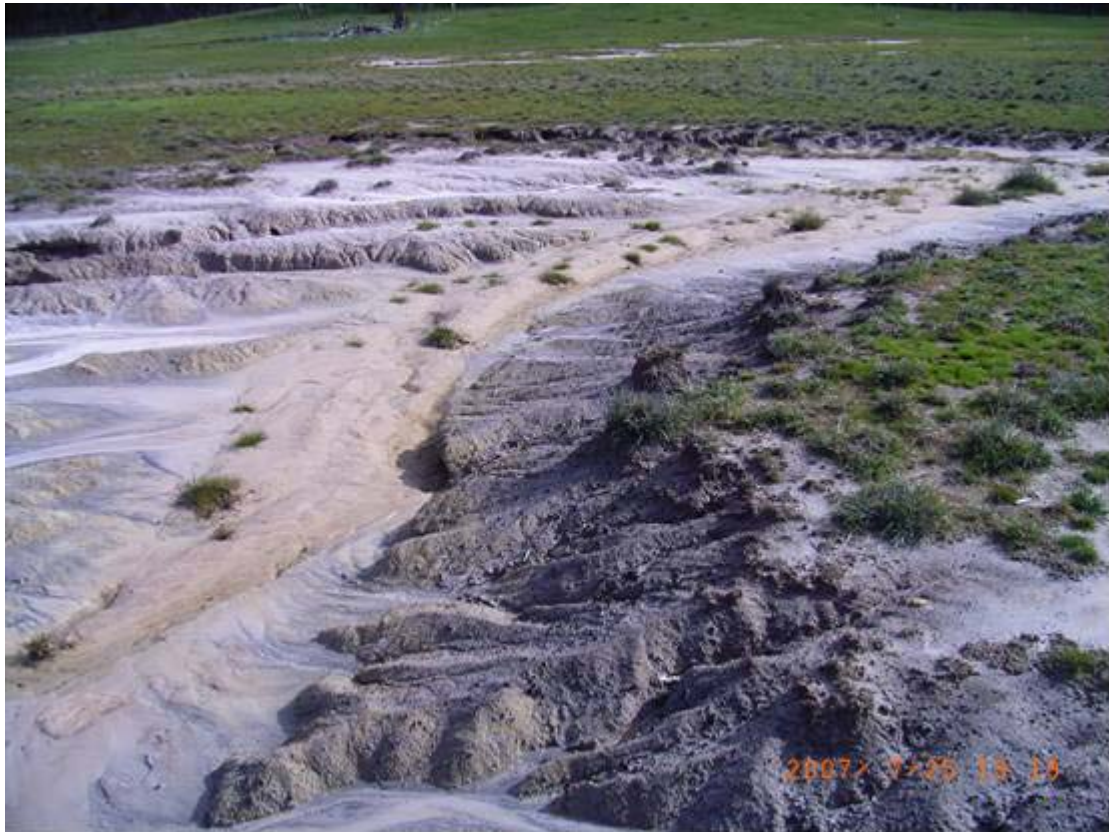
Figure 3 Within some saline areas, micro depressions may accumulate sufficient surface water to dilute soil salinity at and near the surface and allow tolerant and ephemeral species to germinate on the floor of the micro depressions.