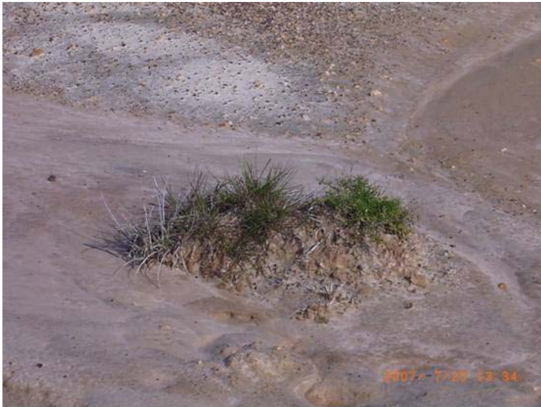
Figure 2 Leaching may allow vegetation to survive on small, slightly raised areas at the margins or even within salt affected areas

If care is not taken, these temporary effects may result in assessments that underestimate the level of apparent salinity at the soil surface. Again, seasonal climate events, micro-relief and the broader site characteristics should be taken into consideration when classifying a site.