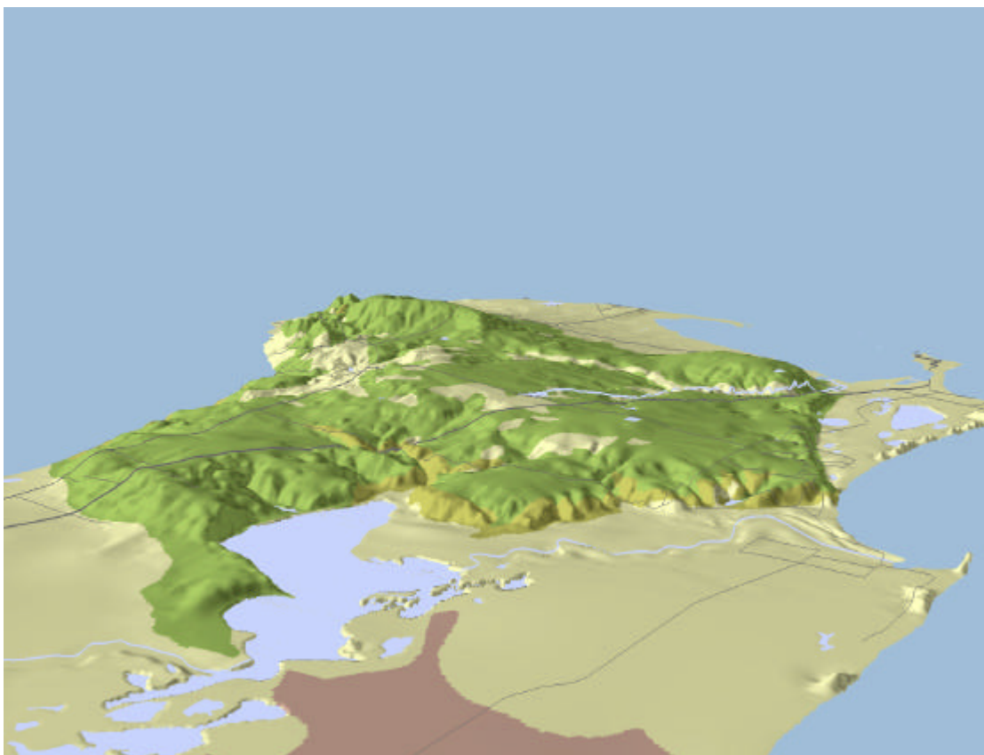
Figure 21 Three dimensional classification of DEM to three different datasets (aspect, slope and elevation)

DEMs have been developed to generate slope ranges and formulate relationships between slope, landform and soil characteristics. DEMs with a 20 m pixel resolution were developed for the WCMA region from 1:25 000 scale topographic data. In the more steeply dissected country the DEMs provided an excellent background dataset to assess for changes in landform and associated soils/soil distribution. The DEMs were also used to generate slope classes and relative elevations that conform to erosional landform patterns as defined in McDonald et al. (1990). These derivatives are useful to identify areas of changing landforms and break-of-slope, indicating the occurrence of a changing process, as well as assisting classification of landforms into a consistent format (e.g. cones classified to hills, low hills and rises).